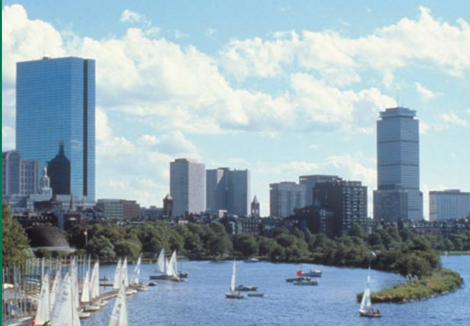
Sailboats in St. Charles Basin

an open-air walkway through prime urban space that weaves 15 acres of new public parks, gardens, fountains, plazas, and tree-lined promenades in the path where the old elevated highway once stood. The Greenway provides access to new tours, museums, walking trails, hotels and restaurants and the 44-mile Boston HarborWalk makes the coastline accessible to all.