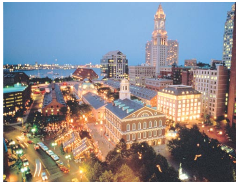
Faneuil Hall Marketplace at dusk

Information on where to stay, where to eat and what to do can be found on Boston's official visitor website www.BostonUSA.com and you can find Great Deals on all of the above at www.BostonUSA.com/GreatDeals . For more information and help planning a trip call 888-SEE-BOSTON or email visitus@bostonusa.com .