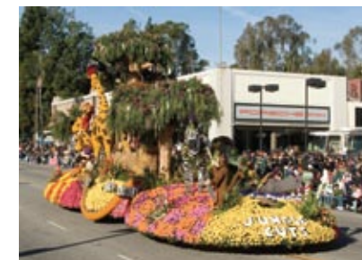
The 2010 Cal Poly Rose Parade float

Pomona's religious community is strong and growing. More than 100 houses of worship, of varying denominations, welcome newcomers with open arms. The City's faith community offers