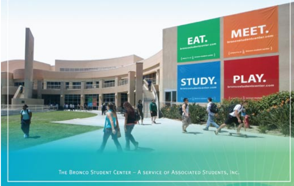
THE BRONCO STUDENT CENTER – A SERVICE OF ASSOCIATED STUDENTS, INC.