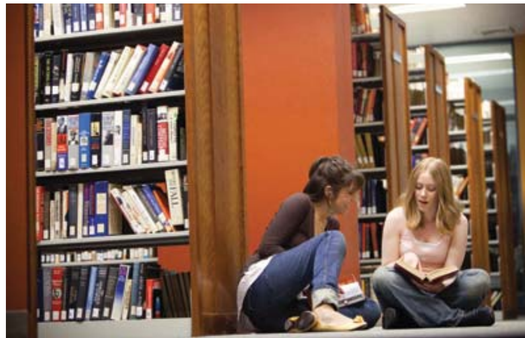
Marymount Manhattan College students can select from 19 majors within five academic divisions.

year. The annual premium for students residing in MMC housing is $369. The annual premium for commuter/off campus students is $235. Parents are encouraged to consider this option. Information about the plan was mailed early this summer. If you are interested you can access the A.W.G Dewar Plan information online at www.collegerefund.com to apply. ■