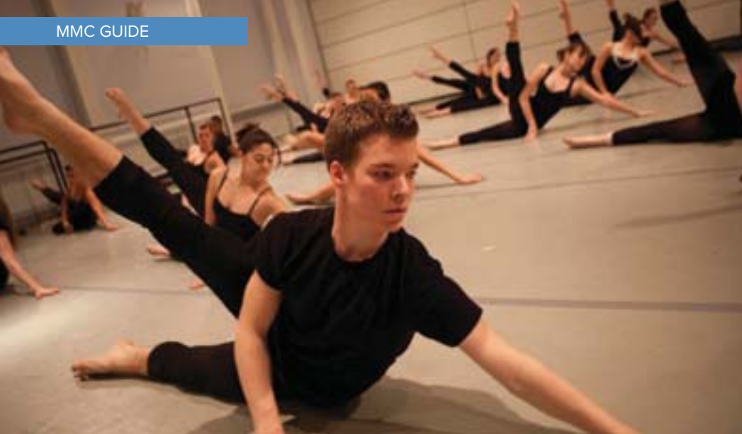
The Dance Department offers professional training in dance technique and a rich liberal arts curriculum.