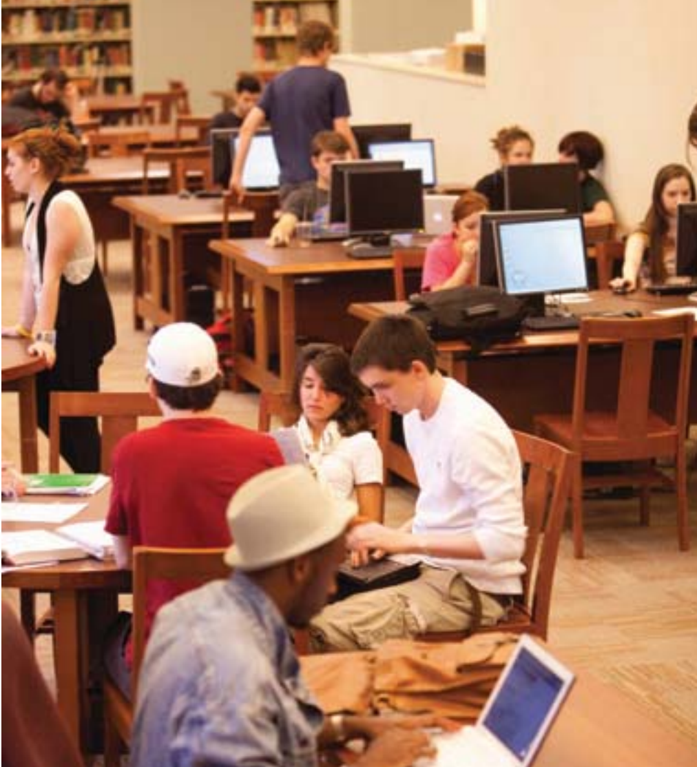
The Thomas J. Shanahan Library is a helpful resource for MMC students.

recognize outstanding contributions to education. Lambda Pi Eta is the National Communication Association's Honor Society. The MMC chapter recognizes, fosters and rewards outstanding scholastic achievement in communication studies. The Omicron Delta Kappa Society, Inc., the National Leadership Honor Society for college students, recognizes and encourages superior scholarship, leadership and exemplary character. Membership in ODK is a mark of highest distinction and honor. Pi Sigma Alpha , the national political science honor society, exists to encourage and reward high achievement in the study of political science. Psi Chi is the National Honor Society of Psychology at MMC. To be considered for admission, a student must either be a major in Psychology or be recommended by the Psychology faculty. The purposes of Sigma Beta Delta are to encourage and recognize scholarship and achievement among students of business management and administration, and to encourage and promote personal and professional improvement in a life distinguished by honorable service to humankind. The purpose of Sigma Tau Delta , the International English Honors Society, is to confer distinction upon students of the English language and its literature.