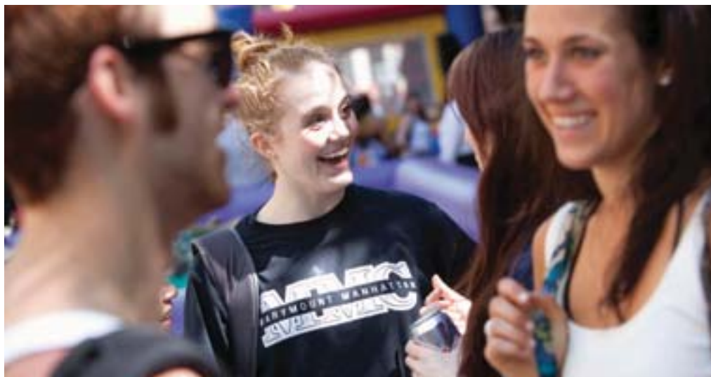
There are many opportunities for MMC students to engage and make new friends.

The primary responsibility of the Department of Campus Safety is to ensure a safe environment for our students, employees and visitors. There is 24/7 security and/or concierge service provided on campus, at the 55th Street Residence Hall, at the de Hirsch Residence Hall, and at Manhattan Park on Roosevelt Island. The department maintains an excellent working relationship with the New York City Police Department and the police precincts that provide service to all MMC facilities. The Director of Campus Safety and Security Supervisors are all former members of the NYPD. For information, call the MMC Main Security Desk at (212) 517-0411.