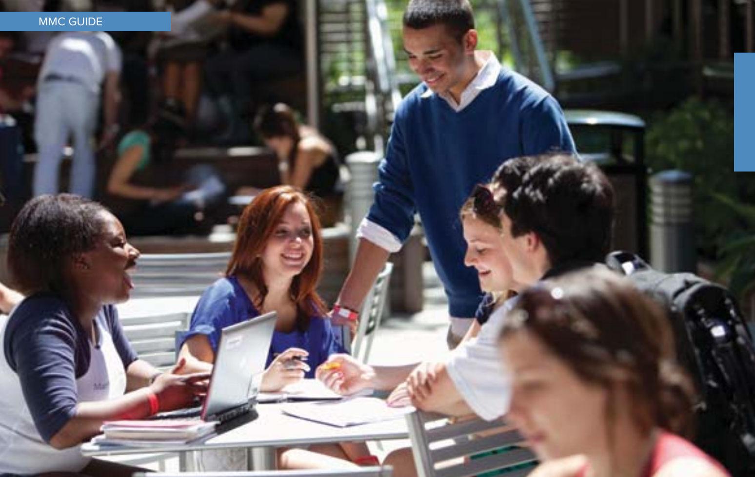
MMC students enjoy an opportunity to meet with classmates on The Lowerre Family Terrace.

Members of the Association of Parents and Friends engage in any (or a combination) of the following: 1) Giving to The Parents Fund as donors, connecting potential funders with the College, and/or volunteering to meet with other parents, friends and associates along with an advancement officer and encouraging them to support the College. 2) Attending local college fairs and serving as ambassadors of MMC alongside admissions counselors. 3) Participating with MMC's Office of Career Services to help students and young alumni channel their educational interest into a rewarding career by offering personal expertise, networking, and job shadowing opportunities. To join or learn more about the Association of Parents and Friends, please call (212) 517-0416 or email apf@mmm.edu . ■