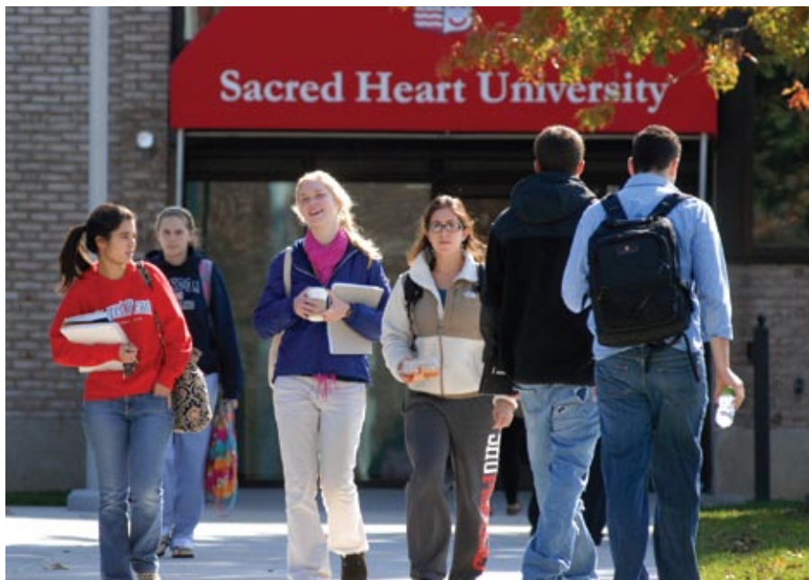
Sacred Heart University

to have in an academic class with me as a freshman? Beyond freshman year? (This question refers to academic class size.)