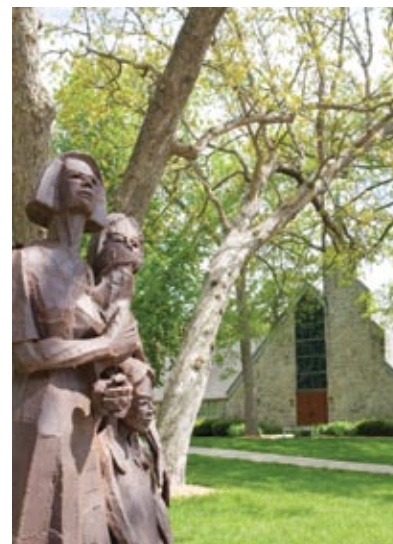
Generations sculpture.

Formerly the site of a renowned natural mineral spring and spa, Pertle Springs is a beautiful place to walk, picnic, watch wildlife and just relax. This area is owned by the University of Central Missouri, and includes Keth Memorial Golf Course, fishing lakes and hiking/biking trails. South of Hale Lake Road, between Holden St. and Pertle Springs Dr.