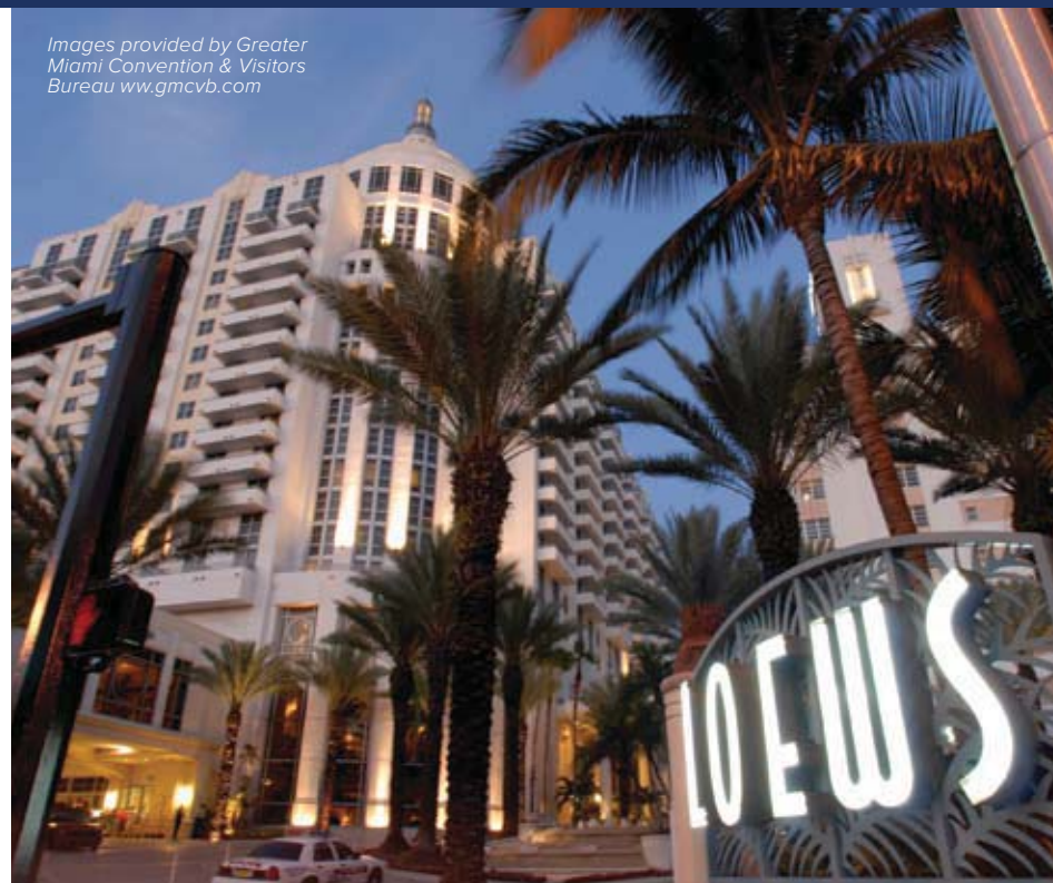
Images provided by Greater Miami Convention & Visitors Bureau www.gmcvb.com

Downtown Miami pulsates with activity as commercial, cultural and leisure pursuits come together. Innovative Downtown Miami skyscrapers compete for your attention, while historic shopping arcades and storefronts packed with merchandise evoke Miami's origins as a trading