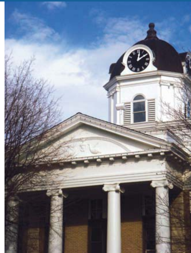
Murray's downtown court house on the square.

If disc golf is not your style, Murray offers many other sporting facilities. The American Society of Golf Architects designated the Frances E. Miller Memorial Golf Course as one of the best designed 18-hole courses in American. A variety of golfing challenges await with over 50 sand bunkers and scenic water hazards. Sullivan's Par 3 Golf and Sports Center features batting cages, 18-hole executive golf course, miniature golf, and a driving range. Murray hosts numerous tennis tournaments a year, being named a "great American tennis town," by Tennis Life magazine in