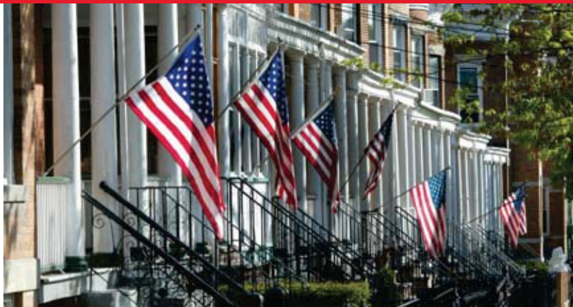
Queens Neighborhood. Stockholm Street. Queens.