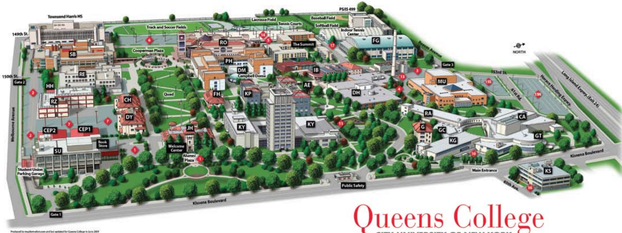
Produced by mapmaker.com and last updated for Queens College in June 2009