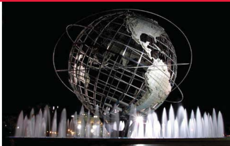
The Unisphere was built in Queens as a symbol for world peace for the 1964-1965 World's Fair. Since then the Unisphere has welcomed visitors, museum and theater goers, Mets fans, and the people of Queens, New York.

diverse 115 square miles on earth. The 7 subway line, dubbed the International Express, has even been designated a part of the National Millennium Trail for its representation of the immigrant experience.