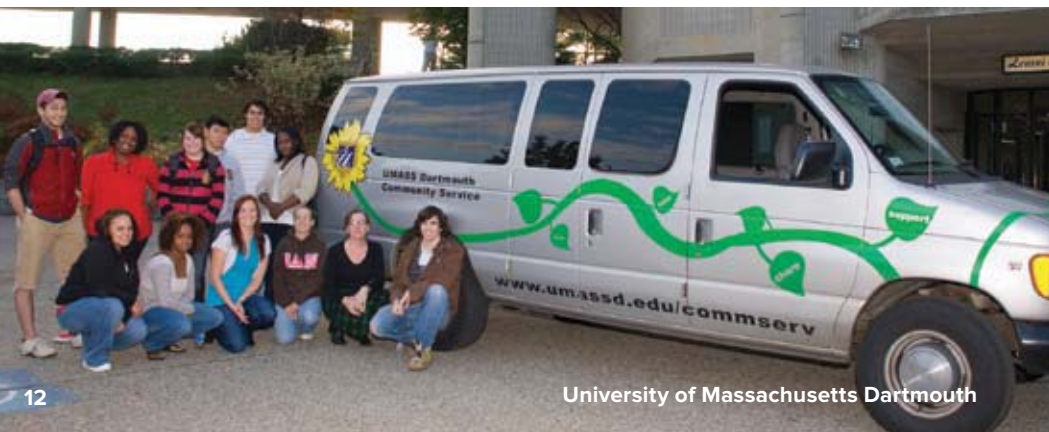
University of Massachusetts Dartmouth

Senior Week: The fun continues through senior year, culminating with Senior Week just prior to Commencement. Seniors are able to finish their finals earlier than the underclass students, and they complete their experience at UMass with some fun activities. With pig roasts, karaoke, a semiformal dinner/dance, trips to places like Boston and Foxwoods, and even a beach day, the seniors have the chance to end their college careers right! ■