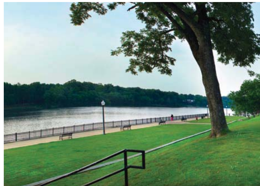
River Road Park