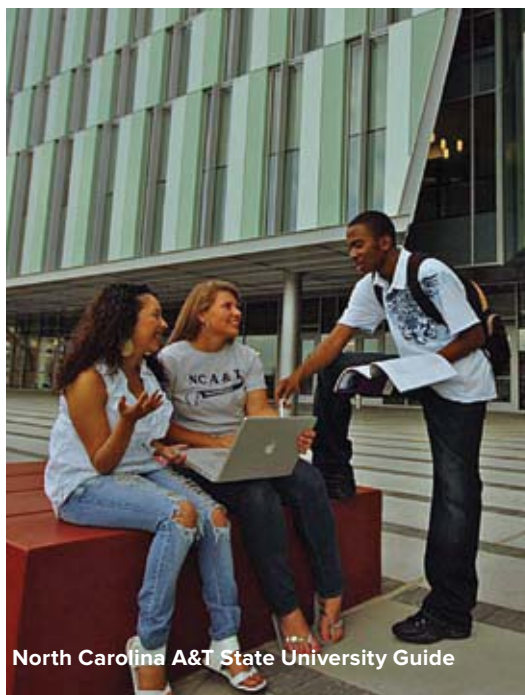
North Carolina A&T State University Guide

Let them get it off their chest, but try to find out what's really bugging them and why. Ask about rest, relaxation, and recreation opportunities and about the things they do in their spare time that they enjoy. Suggest a way to have them integrate those things into college life. Encourage them to stay on campus on the weekends so they can really experience college life. Let college grow on them. Know what resources are available to help if they hit a snag and, whom to call if the going gets too rough. Encourage them to seek out the services Morgan has to offer. A friendly reminder about the services discussed at ACCESS Orientation would be great!