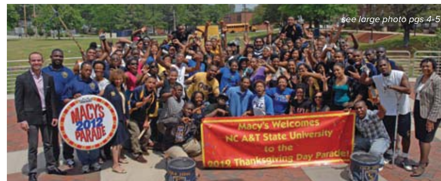
see large photo pgs 4-5

Please make gifts payable to: NC A&T Band Please write "MACYS" in the subject line