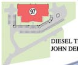
DIESEL TECH/ JOHN DEERE